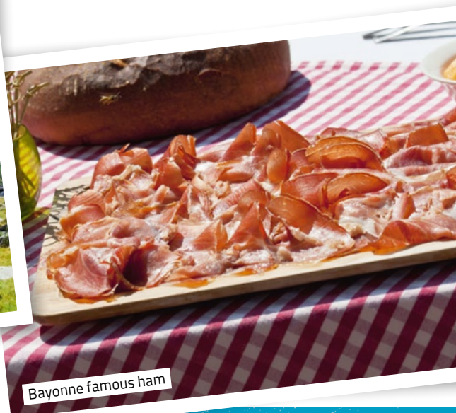
Bayonne famous ham