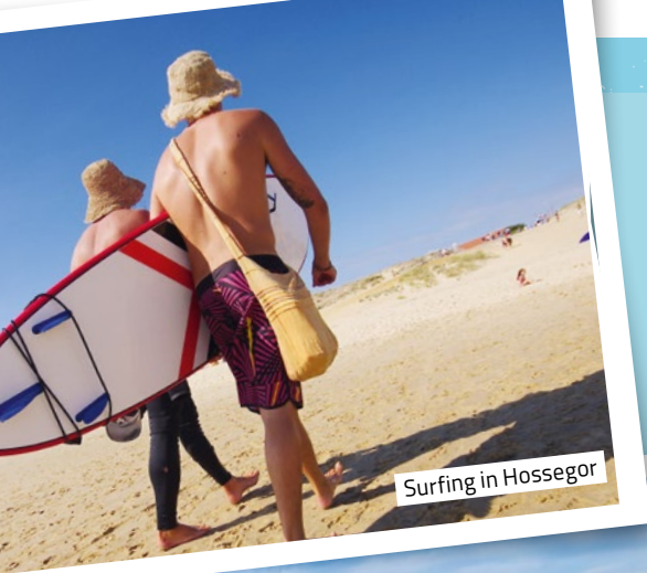
Surfing in Hossegor