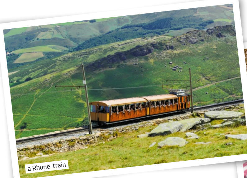
a Rhune train

In Bayonne , sample the ham for which the city is famous, as well as its luxurious chocolate! Spice-lovers can marvel at the timber houses in Espelette , which are decorated with dried red chilli peppers. A treat for the eyes! For dessert, try a " Pastis landais ", a tender brioche flavoured with vanilla, rum, aniseed or orange blossom that will delight your tastebuds.