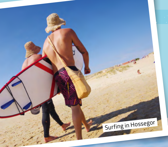
Surfing in Hossegor