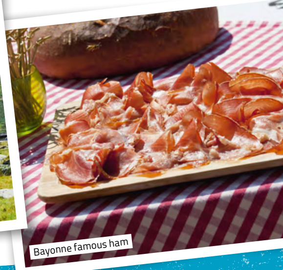
Bayonne famous ham