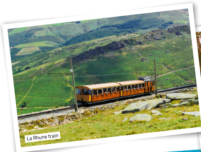
La Rhune train

In Bayonne , sample the ham for which the city is famous, as well as its luxurious chocolate! Spice-lovers can marvel at the timber houses in Espelette , which are decorated with dried red chilli peppers. A treat for the eyes! For dessert, try a " Pastis landais ", a tender brioche flavoured with vanilla, rum, aniseed or orange blossom that will delight your tastebuds.