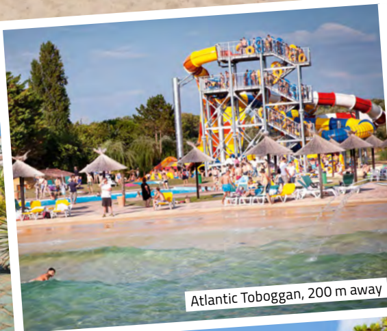
Atlantic Toboggan, 200 m away